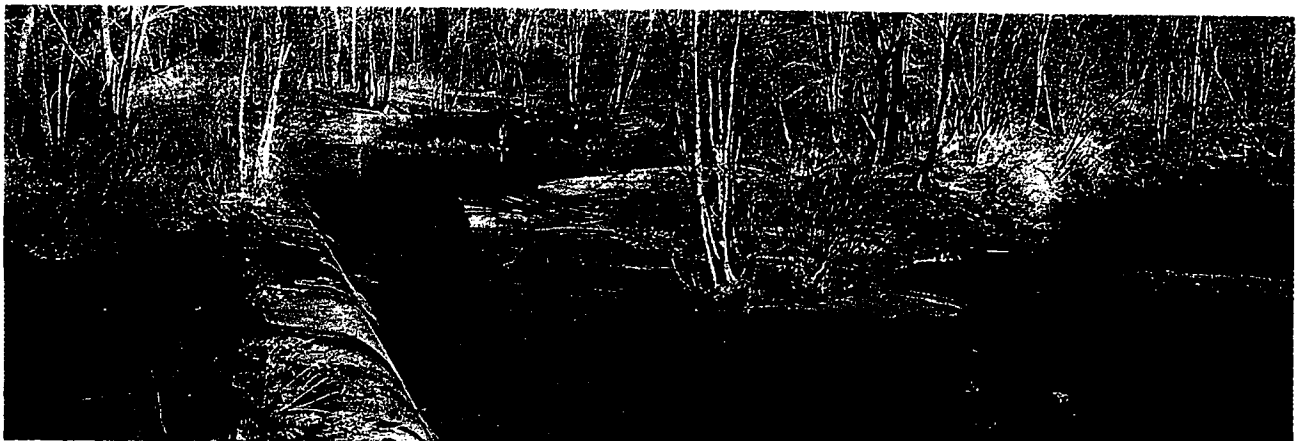
The remnants of the feeder canal of the Morris Canal on the Pompton River at Aquatic Park.

...serve as a focus for redevelopment efforts in the state's river towns, including restoring existing parks and acquiring additional land along the waterways."