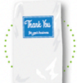
Dry cleaning bags